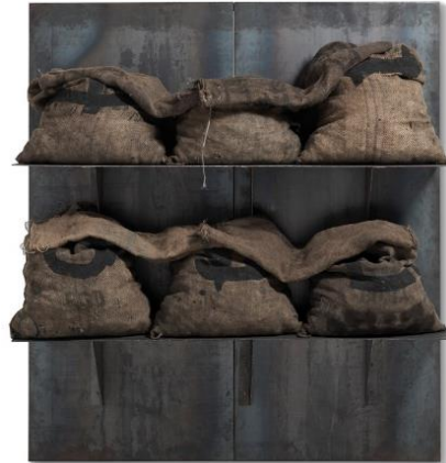
Alighiero Boetti, Segno e disegno 1979 , (1979, estimate: €100,000-150,000) and Jannis Kounellis, Senza titolo , (2002, estimate: €120,000-180,000)