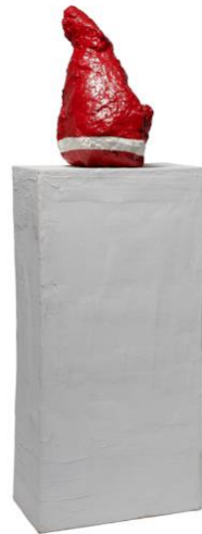
Mario Sironi, Ciclista , (c.1920 estimate: €3,000-5,000) and Franz West, Senza titolo , (1991, estimate: €30,000-40,000)